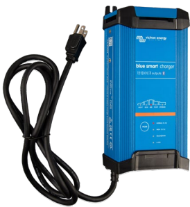
Blue Smart IP22 12/30 (3)