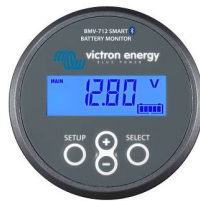
BMV-712 Smart Battery Monitor