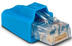
RJ45 VE.Can terminator