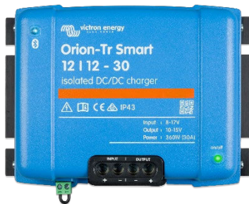
Orion-Tr Smart 12/12-30