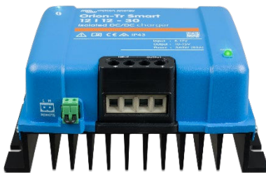
Orion-Tr Smart 12/12-30