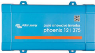
Phoenix 12/375 VE.Direct