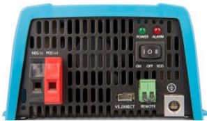
Phoenix 12/375 VE.Direct