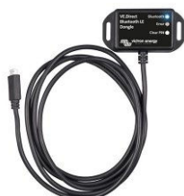
VE.Direct Bluetooth Smart dongle (must be ordered separately)

An excessively high or low battery voltage is indicated by an audible and visual alarm, and a relay for remote signalling.