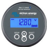
Bluetooth sensing BMV-712 Smart Battery Monitor