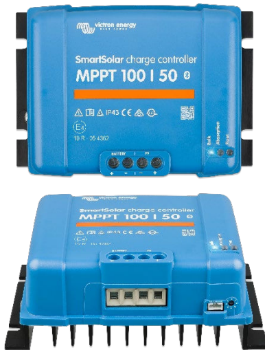
SmartSolar Charge Controller MPPT 100/50