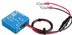
Bluetooth sensing Smart Battery Sense