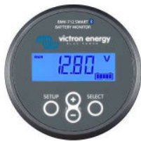
Bluetooth sensing BMW-712 Smart Battery Monitor