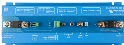
Smart BMS 12/200