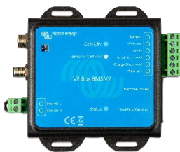
VE.Bus BMS V2