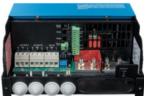
Connection Area 12/3000/120-50

Measures battery voltage and temperature and allows monitoring and control with a smart phone or other Bluetooth enabled device.