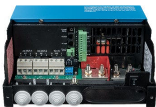
Connection area 12/3000/120-50