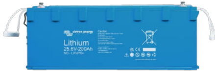
25,6 V 200 Ah Lithium NG battery