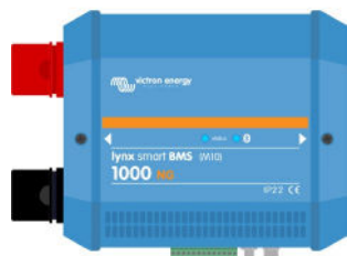
Lynx Smart BMS NG 500 A & 1000 A