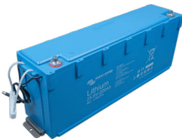
Secured with mounting brackets