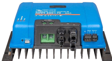
SmartSolar Charge Controller MPPT 250/70-MC4 without display